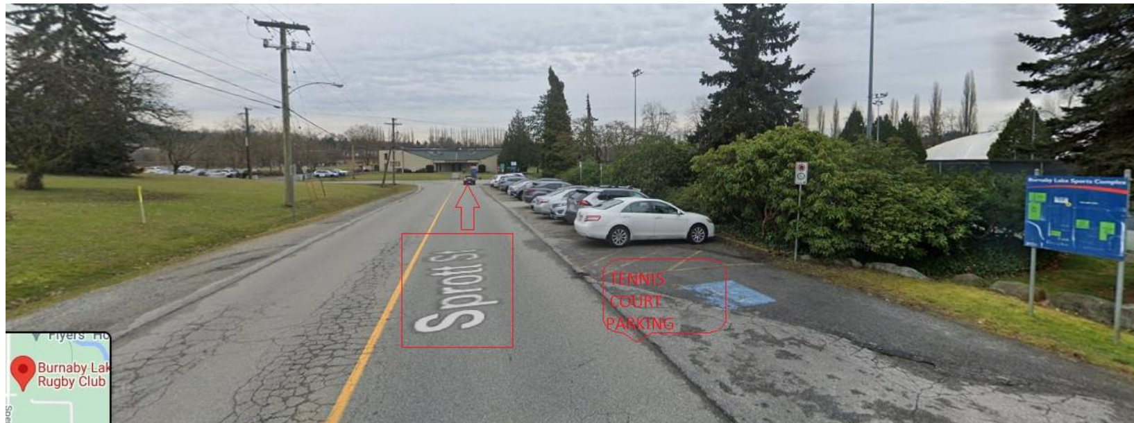
Spratt Eastbound at Burnaby Lakes – Overflow Parking (10-12) at Tennis Courts – Then Right (South) at Sperrling