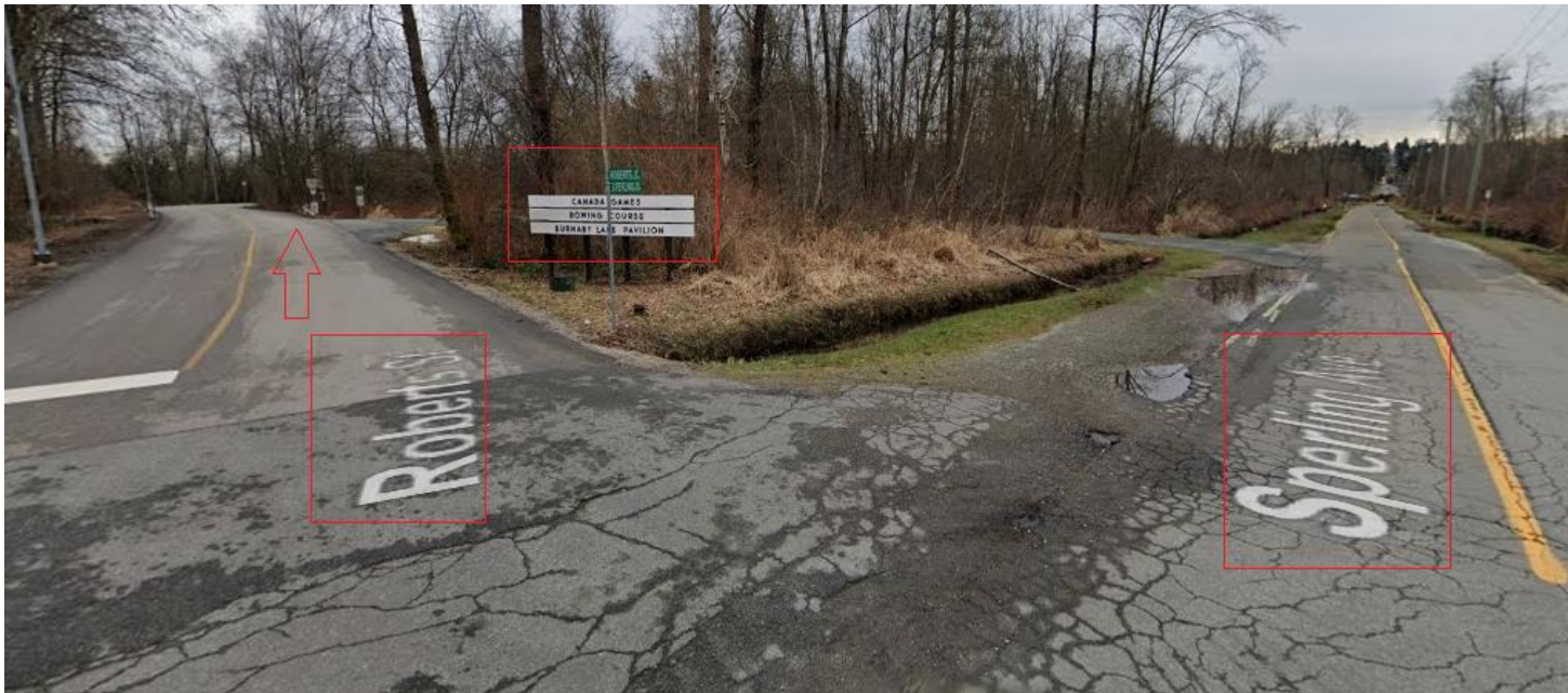
Sperling Southbound at Roberts Intersection (Canada Games Rowing Course Entrance) – Turn Left (East)