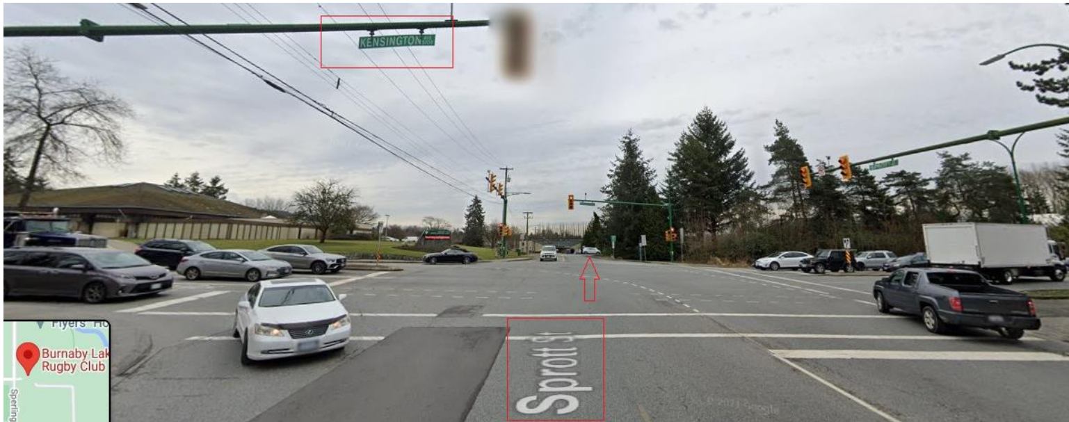
Spratt Eastbound at Kensington Intersection – Right-Hand Lane (Forward) – NO Left Turn from Kensington