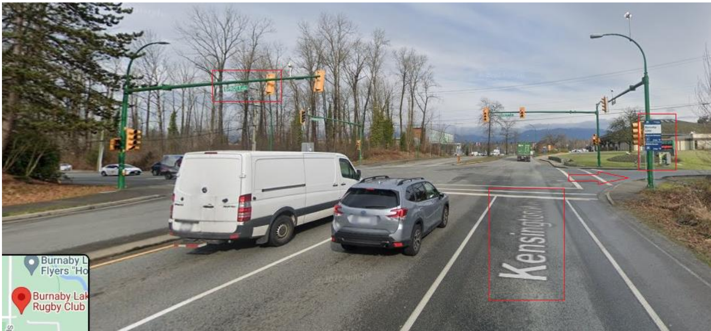
Kensington Northbound at Sprott Intersection – Turn Right (East)