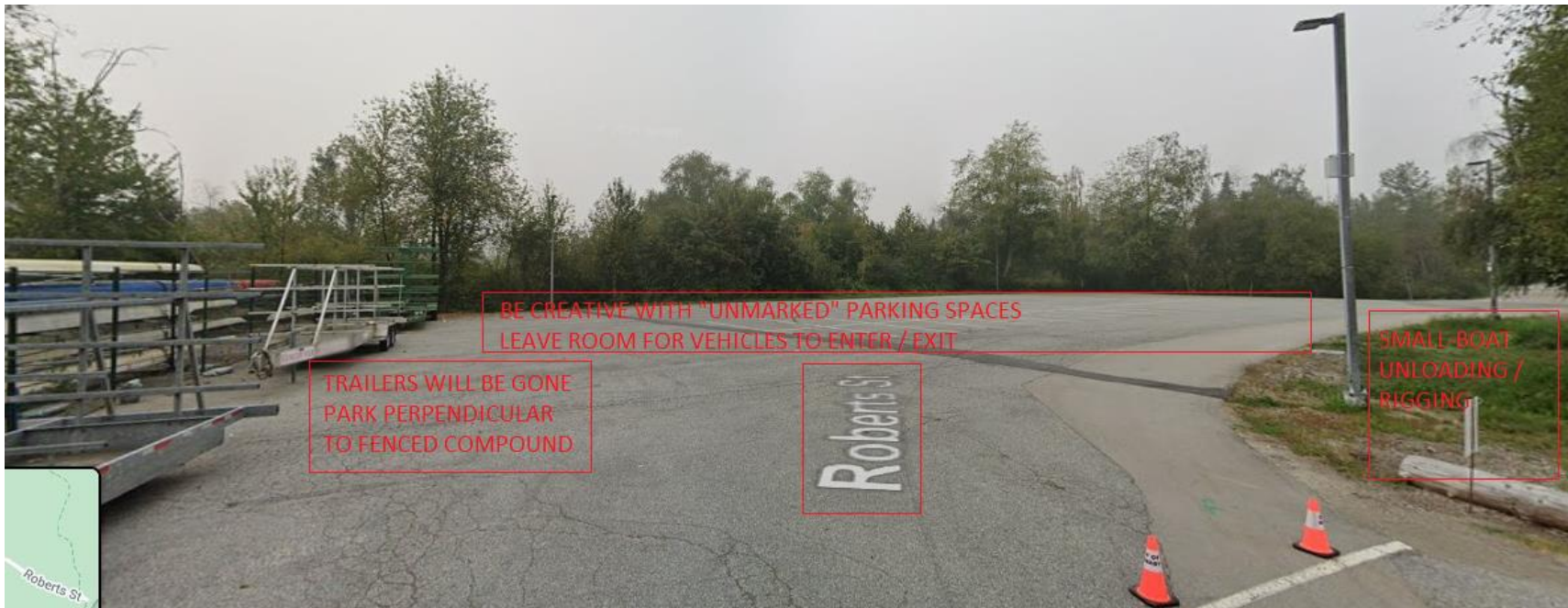
Burnaby Lakes Rowing Course Paved Parking – Trailers Should Be Gone – Be Creative with "Unmarked" Parking Spaces