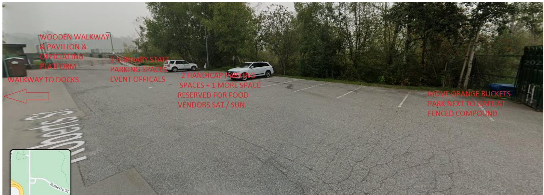
Burnaby Lakes Rowing Course Paved Parking – Do NOT Park in Staff Spaces – Handicap Spaces + 1 More Space Reserved