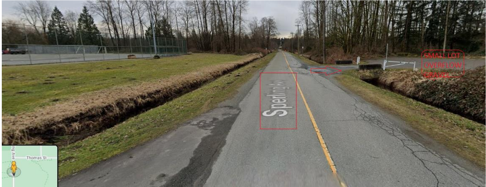
Sperling Southbound – Overflow Parking (10-12) Westside at Gravel Lot – Cross Sperling to Nature Trail