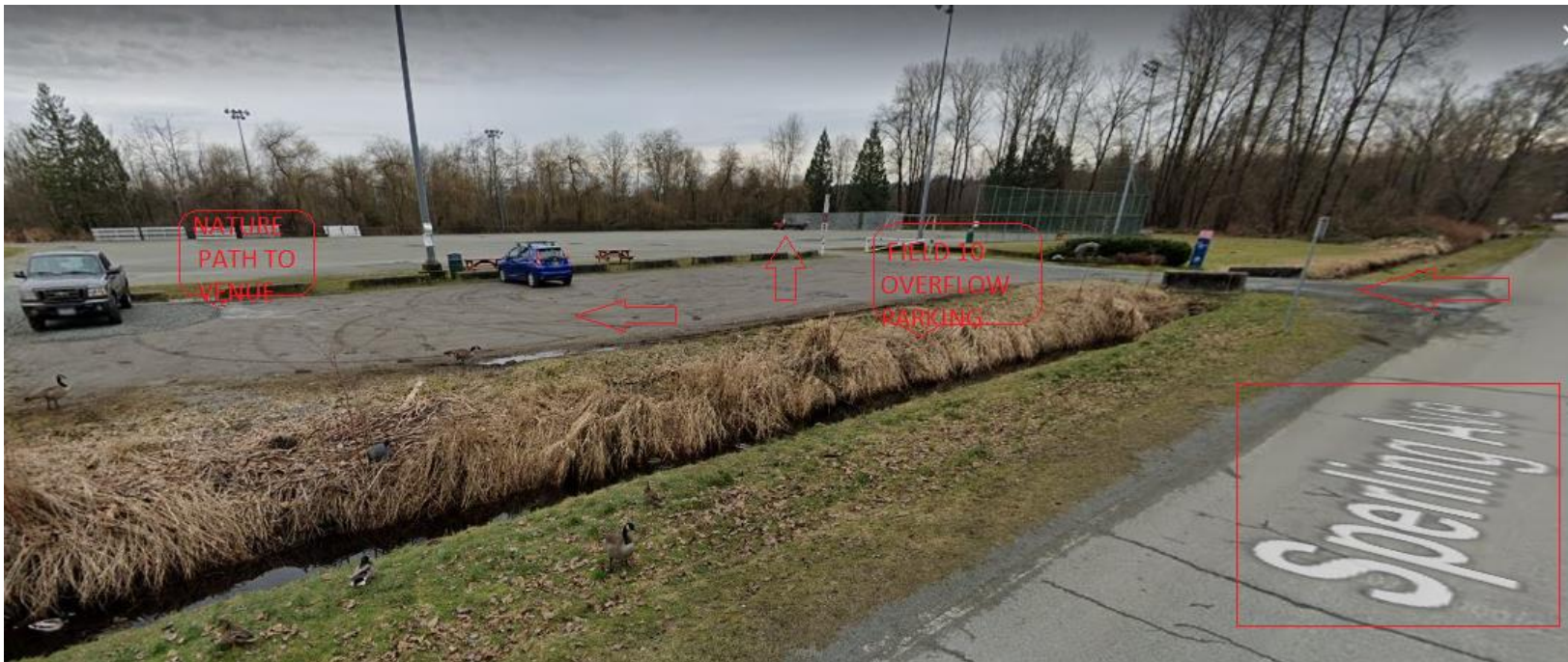
Sperling Southbound – Overflow Parking (90-100) Eastside at Field 10 Gravel Lot – Nature Trail East of Lot to Venue