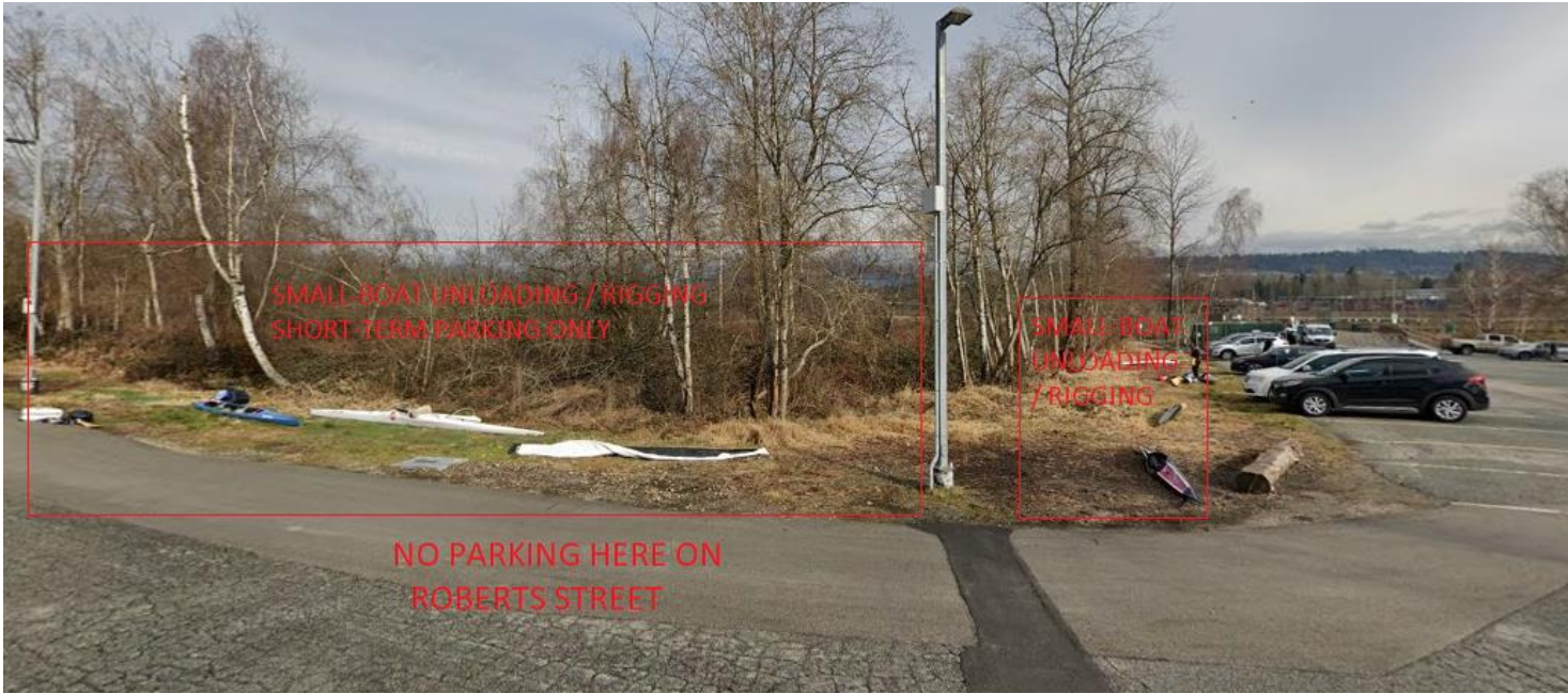
Burnaby Lakes Rowing Course Paved Parking – Grassy / Sandy Area for Short Term Small-Boat Unloading / Rigging