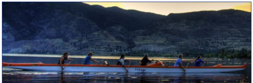
Outrigger Connection Mirage - Kia Pa'a