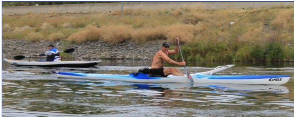
Channel Parkway 10KM Small-Boat Competition

PRCC has hosted a Channel Parkway 10KM small-boat event between Skaha Lake and Okanagan Lake designed to take advantage of the winds that the South Okanagan traditionally gets in the Autumn months where the race direction is determined by which way the wind is blowing. [25]