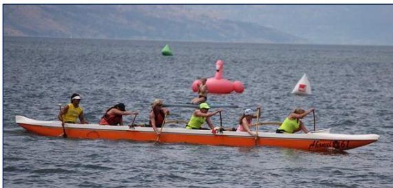
Canadian Class Racer (CCR) - Ahonui