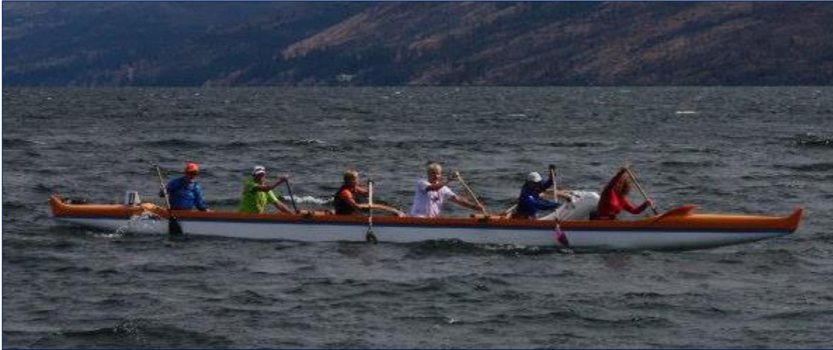
Penticton Racing Canoe Club (PRCC) Hawaiian Class Racer (HCR) with Hawaiian Hawk ama - Lokahi

By 1999, PRCC had acquired two OC6s for their fleet. "The Burrard" CORA loaner canoe came from Comox Valley Canoe Racing Club (CVCRC) in 1997 and the Hawaiian Class Racer (HCR) came from San Francisco Outrigger Canoe Club (SFOCC) in 1999.