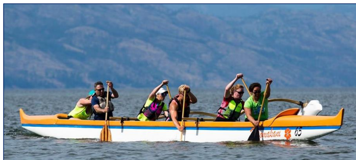
Bradley Lightning - Holomakani