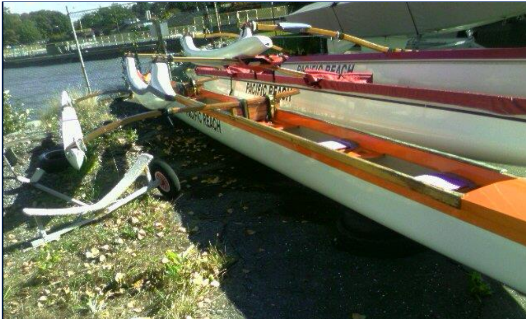
Orange-deck / white-hull (Keahou) Dennis Campbell Rhino at Pacific Reach Kits Beach Compound

As fate would have it, Prince Rupert Outrigger Association would acquire the last of the two Dennis Campbell Rhinos from Sproat Lake Canoe Club (SLCC) in 2009 and trailer this OC6 that had travelled from California to Vernon to Penticton to Victoria to Sproat Lake Canoe Club (SLCC) onwards to Yellowknife, where it would spend several years there until it made its way to the Cow Bay Marina at Prince Rupert in 2012. This Dennis Campbell Rhino has likely covered more distance than any other OC6 in Canada. The design of "The Burrard" and the two Dennis Campbell Rhinos, each with the distinctive "Rhino horn" on the stern offers credence to the theory that these three OC6s are "related" in that the Dennis Campbell Rhino mould may have been the source of "The Burrard" brought to Canada in 1986/1987 and the two Dennis Campbell Rhinos brought to Vernon in the early 1990s.