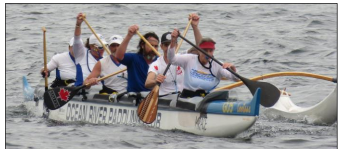
Outrigger Connection Mirage Lootsas