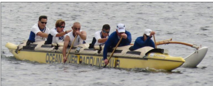
Clipper Advantage Camosung