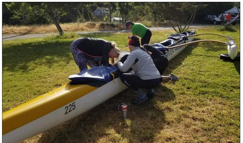
Outrigger Connection Mirage Tillicum