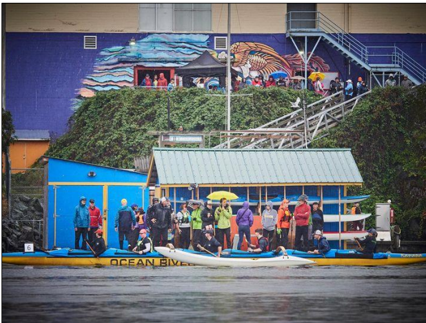
Clipper Advantage Kanaka

Current Designs were small boat specialists and continued to build the Outrigger Connection Stingray OC1 and The Viper OC1 models. [21]