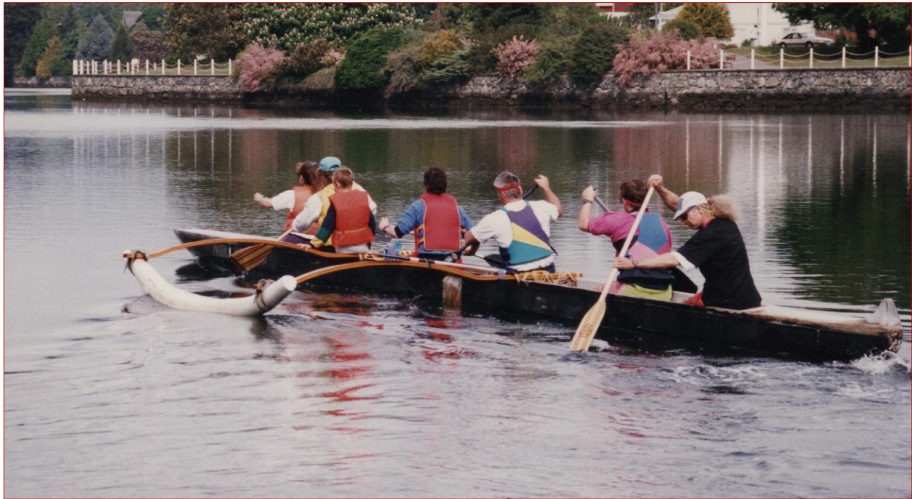
Please note the distinctive "Rhino horn" on the stern of "The Burrard"