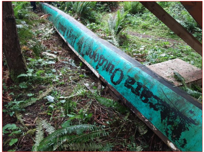
"The Burrard" RIP 1985-2006