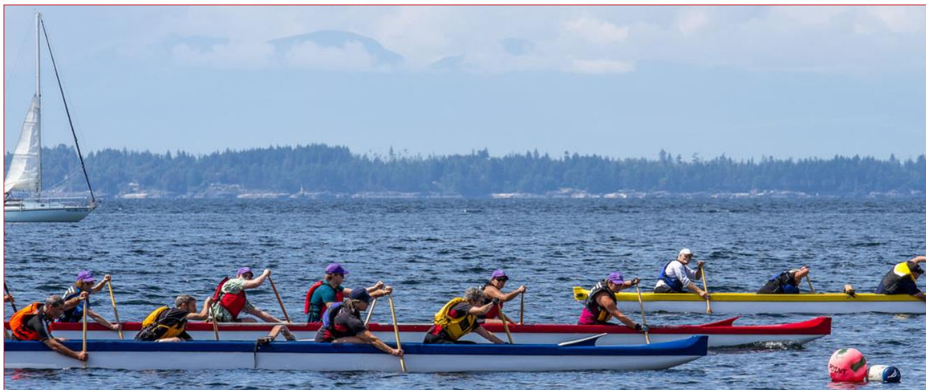
FCRCC Canadian Malias to Gibsons Paddle Club to Powell River Outrigger Canoe Society to Pearson College

"The Burrard" was with False Creek Racing Canoe Club from 1986-1989. By the time "The Burrard" moved onwards to its next home, False Creek Racing Canoe Club had acquired at least one of their three Canadian Malias from Calmar Fibreglass. These three (red-deck, blue-deck, yellow-deck) Canadian Malias would eventually move onwards to Gibsons Paddle Club to Powell River Outrigger Canoe Society to Pearson College.